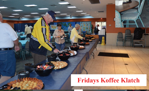
Fridays Koffee Klatch