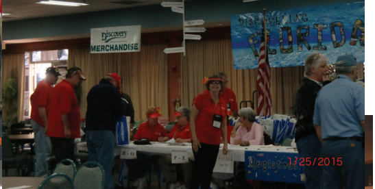
Registration Tables and everyone helping