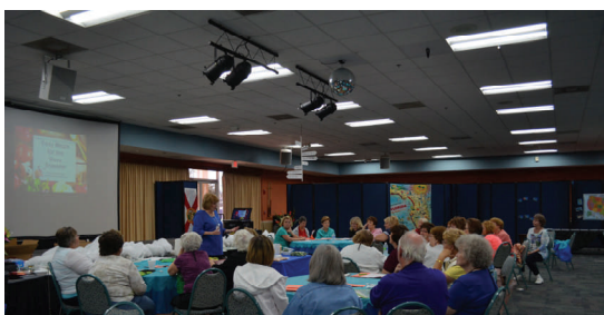
Easy Meals for the Busy Traveler Each lady took home a complete chicken dinner