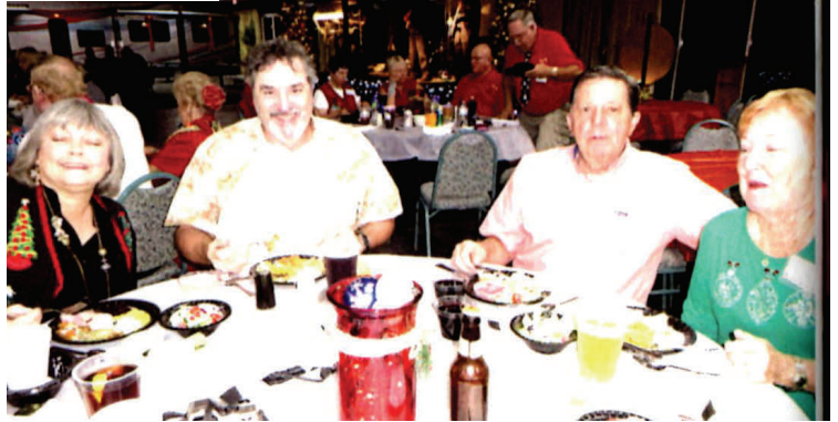
We had a Delicious Dinner and fantastic entertainment and in some cases we were the entertainment. I'm Just Saying