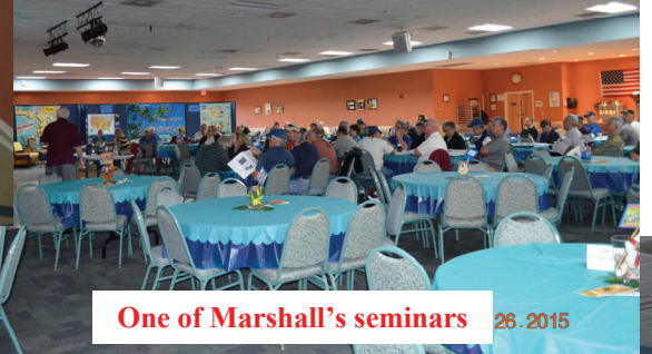
One of Marshall's seminars 26.2015