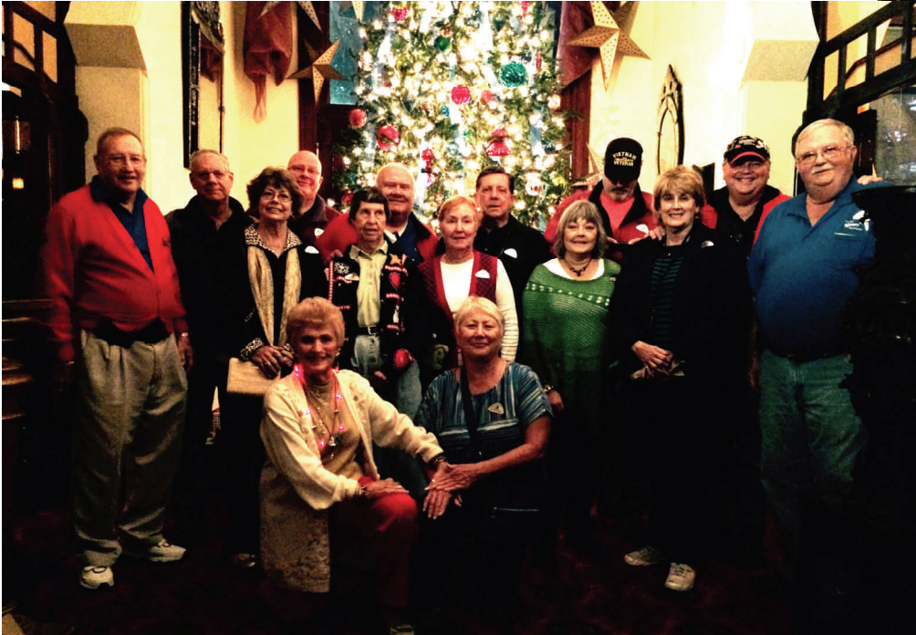
Our trip to the University of Tampa's Plant Museum decorated for Christmas