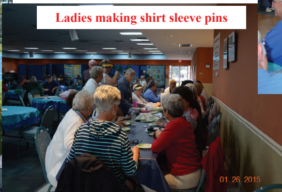
Ladies making shirt sleeve pins