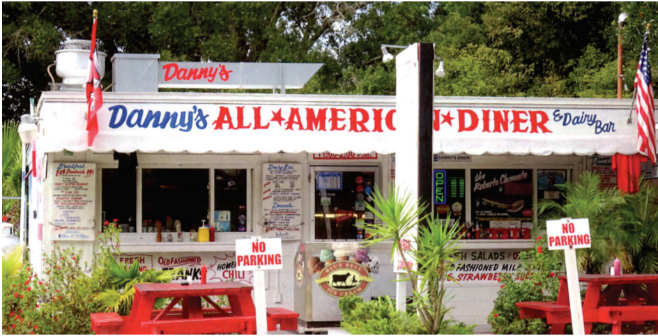
Doesn't look like much but we had a great lunch