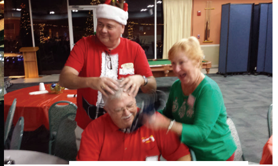
Hair Messing Contest