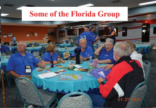
Some of the Florida Group