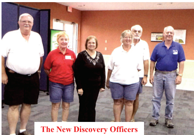
The New Discovery Officers