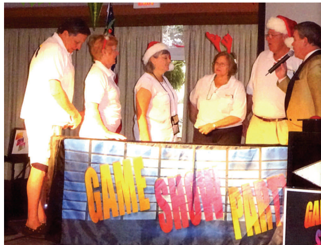
Another Family Feud Team