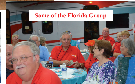
Some of the Florida Group