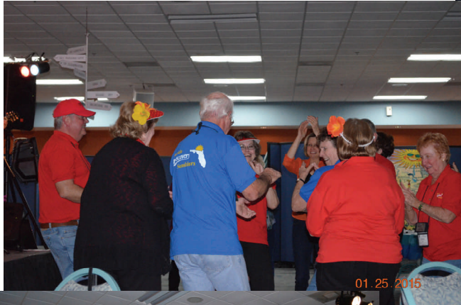
Doing the YMCA