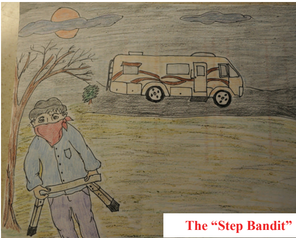
The "Step Bandit"

We had the "Sewer Hose Bandit", now we have the "Step Bandit". It has just come to the attention of the authorities at Lazydays that there was a step bandit that struck in plain daylight while one un-identified couple was out to lunch. Now this was not just any old step, it was one very expensive step with adjustable legs and was also brand new.