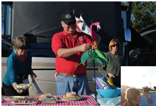
Happy hour with all the good snacks just waiting to be eaten.