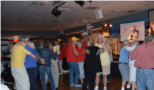
Enjoying the dancing to the Marlinaires