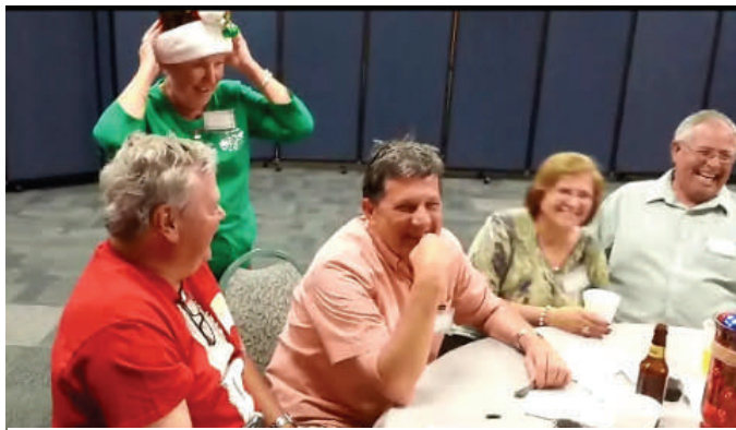
Can't believe she did that to Tom and got away with it!