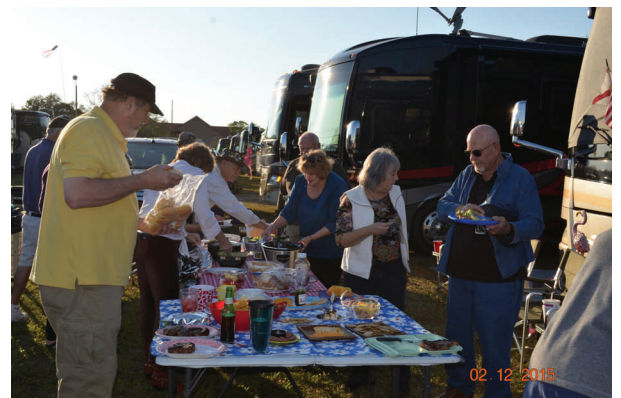
Bring your own meat and a dish to pass