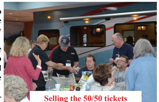
Selling the 50/50 tickets