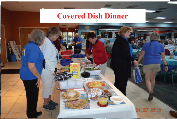
Covered Dish Dinner