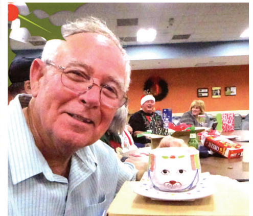
"White Elephant Gift Exchange"