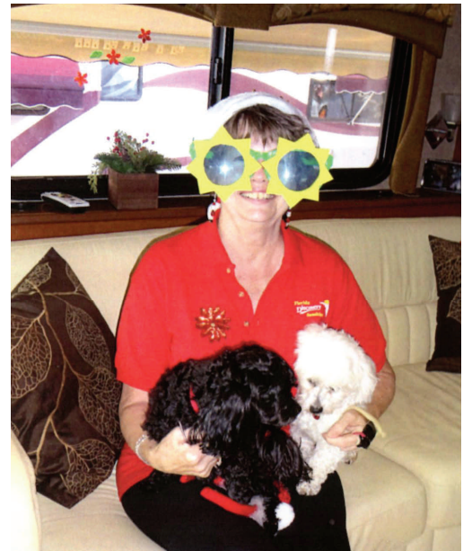
Our Winning Family Feud Team Captain