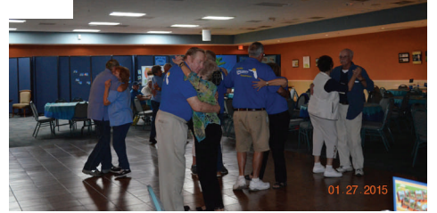
Enjoying Some Slow Dancing